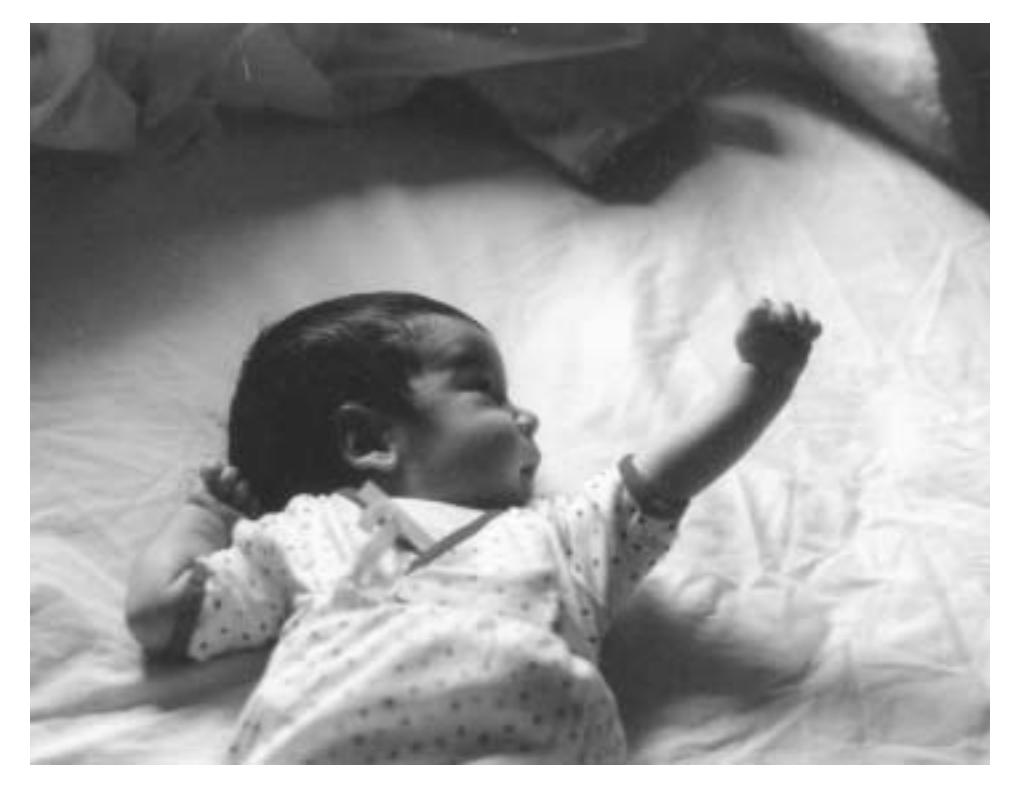
FIGURE 5.A normal baby showing the asymmetrical tonic neck reflex.