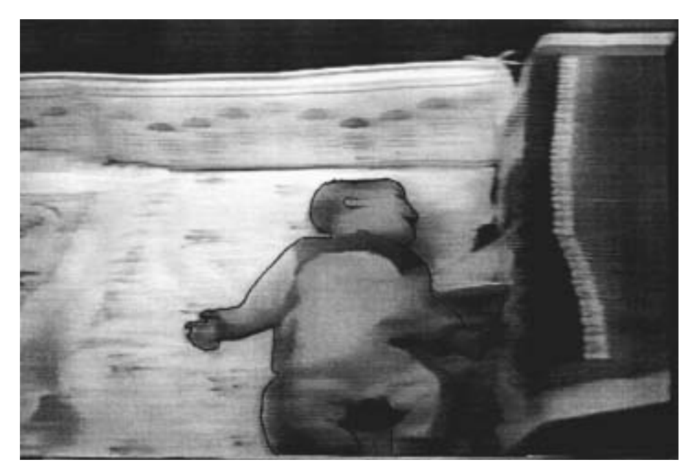
FIGURE 1. An 8-month old Asperger's infant is lying with its head facing its own left. In a normal infant, this would signal turning over to its left, if such a turn were to occur.