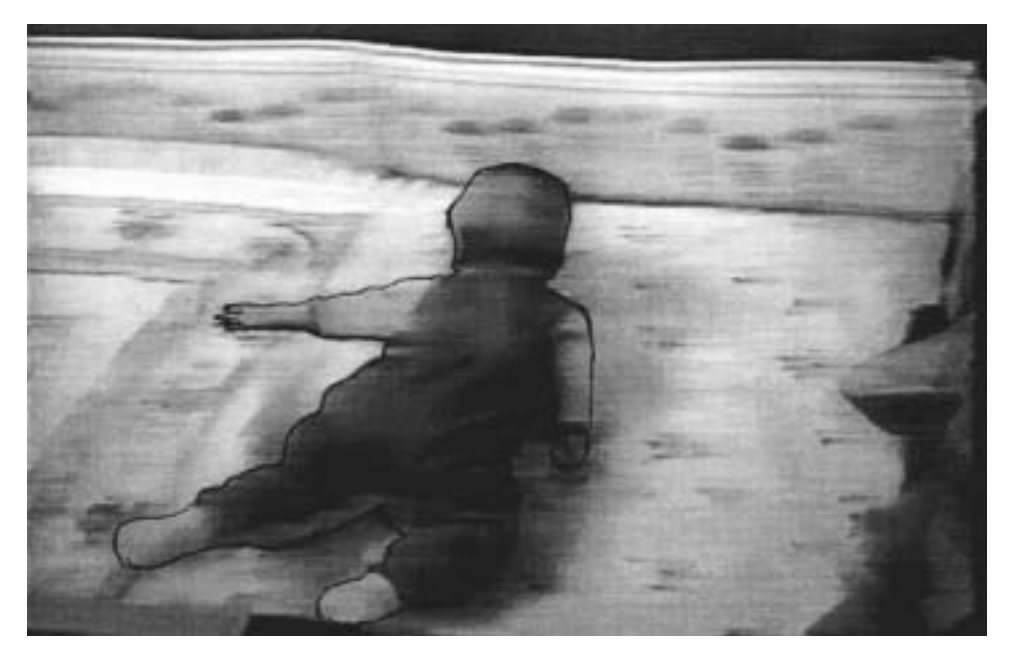
FIGURE 4. The infant has fallen over onto its stomach, the left arm still in the extended position.

FIGURE 3. The infant swings its extended arm upward and towards its own right. The head and eyes are locked to the arm during the asymmetrical tonic neck reflex, so the head and body turn over in the direction in which the arm is swinging: i.e., in the "wrong" direction, according to the direction in which the head was turned at the beginning of this reflex sequence.