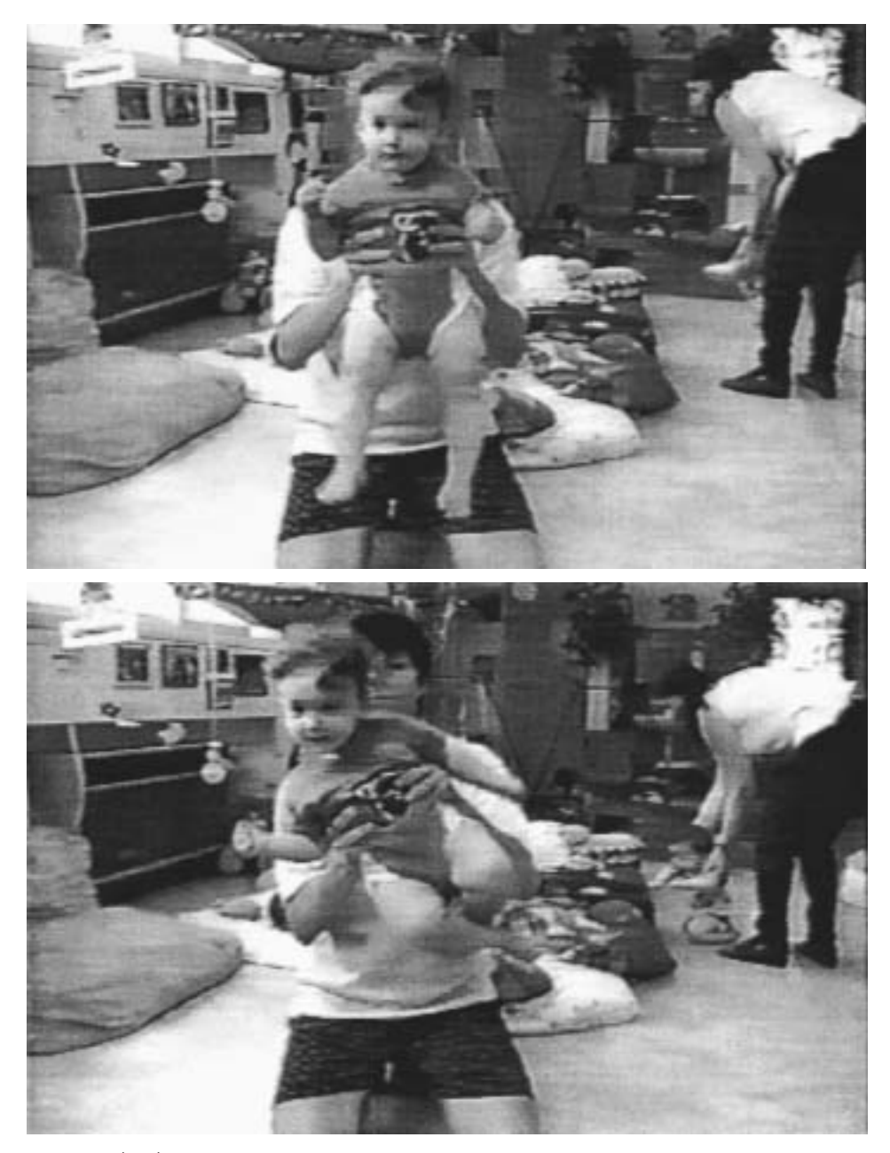
FIGURE 6.(top) The "tilting test" in a normal six month old baby. The head and body are held in the vertical position. (bottom) The child's body is slowly tilted about 45 degrees to the child's right. The child maintains its head in the absolute vertical, rather than remaining in line with the mid-line axis of the body. The slow tilt is then repeated toward the other side, and the normal baby will again maintain its head in the vertical. In a sub-group of autistic children, the head remains in line with the mid-line axis of the tilted body, rather than orienting itself to the absolute vertical, on one or both sides of body tilt.